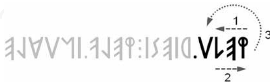
Figure 2: Semi-palindrome part.